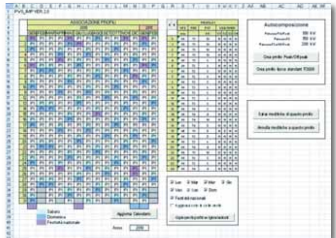
Configurator for Excel profiles.

There are other configurable detailed parameters as: working time, cycle time, initial insensibility, safety margin, Power/Tariff of default, minimum operating, minimum rest time, priority, Job, Force-ON; Force-OFF. This detailed parameterization allows the best configuration of every situation and can satisfy all requirements. A specific application in Excel allows to prepare, save and send particular profiles of the equipment.